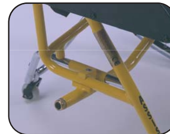
Depth adjustable axle (ASSIST 2)