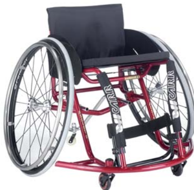
ASSIST 2 SPINERGY