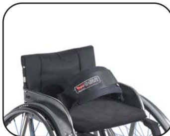
PVC leg keeper belt