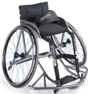
WIND TITANIUM SPINERGY

An ultra-lightweight structure and an extreme agility make this wheelchair a leader in basketball courts all over the world.