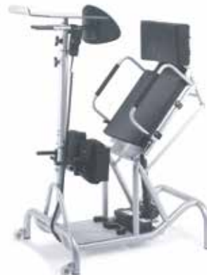
STAND-UP EE "with powered elevation and manual traction"