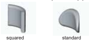
(*) not available on Stand-up Junior