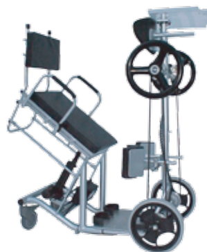
STAND-UP ETM "with powered elevation and traction"